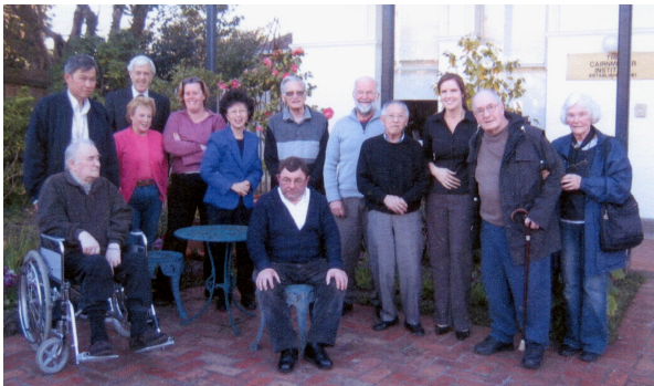
This program has been free for stroke survivors in 2006 thanks to generous donors.

Rehabilitation following stroke can be a time of fear, stress and uncertainty as the survivor’s emotional life is thrown into turmoil. In 2006, our clinic made contact with over 75 survivors of stroke.